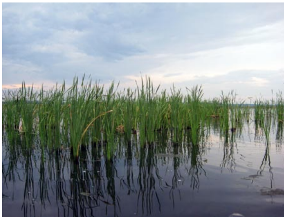
Both photos: Thompson Lake. Former farmland adjacent to lake was returned to its natural floodplain habitat and aquatic vegetation re-established.